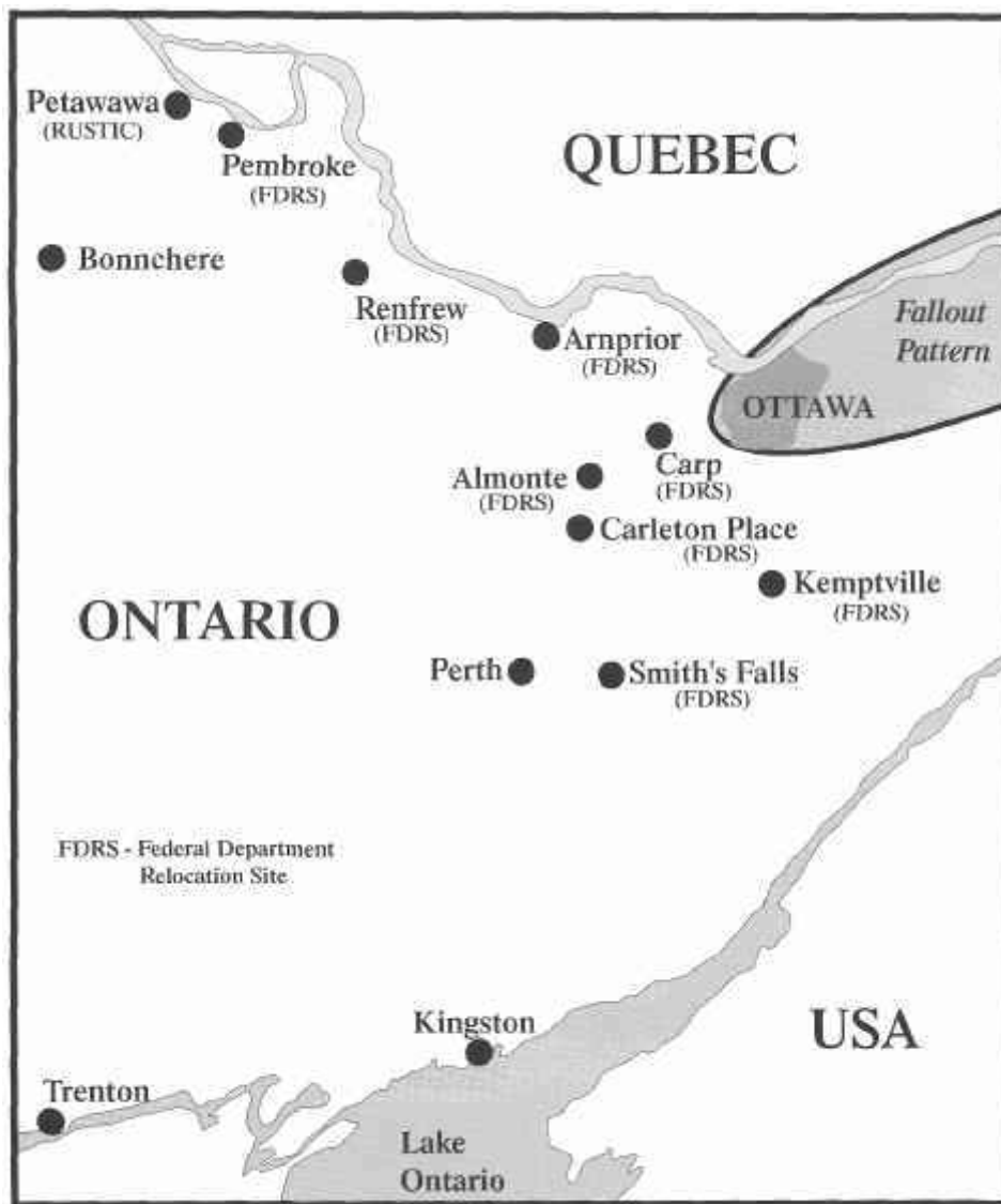
Map 2 - The RUSTIC Plan, 1959-1960 and Federal Department Relocation Sites

underground buildings: a communications centre, an administrative centre, and an executive centre. Each would house 500 people. Some planners considered this to be too vulnerable: all three buildings, though underground, were clustered together and there was only one communications centre. An alternative was to split the communications between two 750-man buildings and put more distance between them. This lowered the administrative efficiency of the complex and increased costs, since communications would have to be duplicated. 31